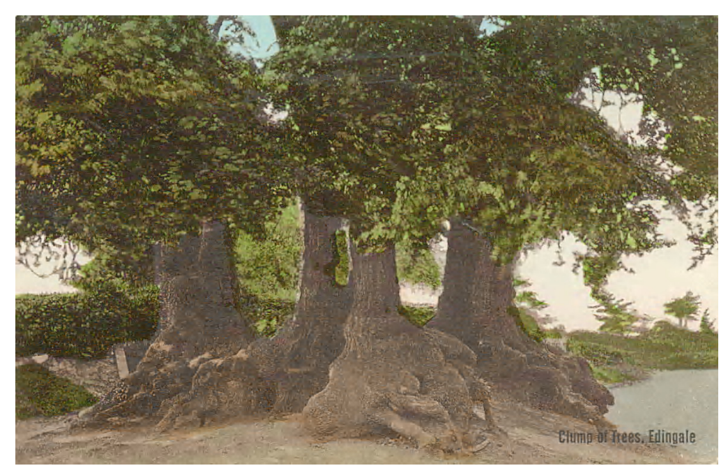
The tree roots in about 1920

Empire. This trade may have had an impact further inland, as the lead miners of Derbyshire seem to have exported to the Roman Empire well before the invasion.